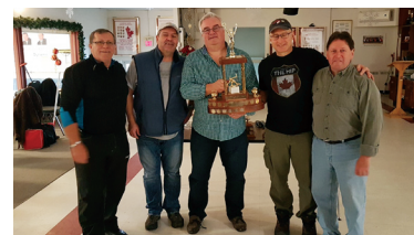
A.C.T./U.C.T. Annual Bonspiel Winning Team MCTV

FOR INFORMATION AND EVENTS GO TO UCTSUDBURY.WEEBLY.COM