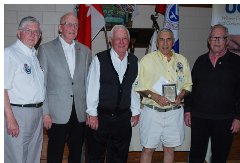
50 Year Members

THANK YOU, members of Council 1051 for another Spectacular Year!