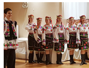
St Mary's Ukrainian Dancers

Congratulations to this year's award winners: